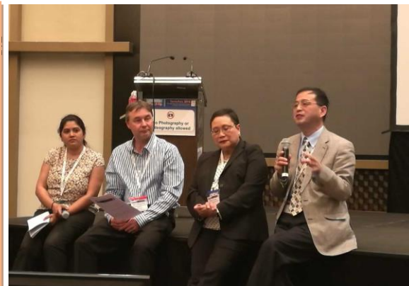
FOP WORKSHOP Q&A SESSION